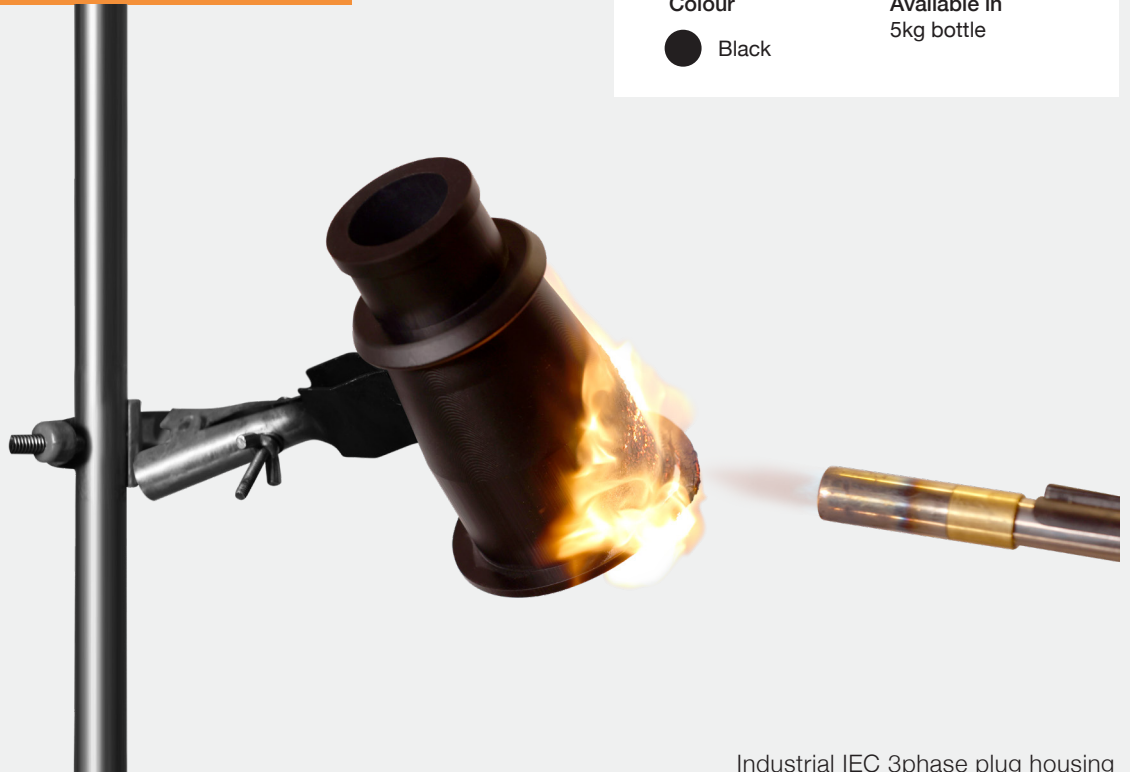
Industrial IEC 3phase plug housing

Rigid DLFR is Photocentric's first Daylight Flame Retardant resin with UL 94 V-0 certification, even showing self-extinguishing properties in the green state. Combined with an exceptionally high HDT and high tensile modulus, it is ideal for 3D parts in industries such as aerospace, automotive and railway. Easy to print and process due to its low viscosity. Printed parts exhibit a superior level of detail and dimensional accuracy, making it the perfect choice for connectors and fittings for both consumer and industrial applications.